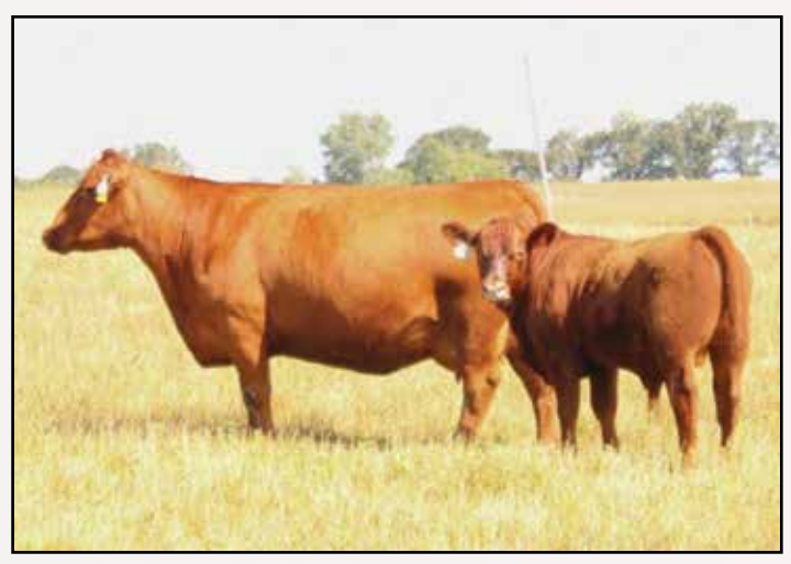
BKF FINISHLINE 2020 son on his 6-year-old dam